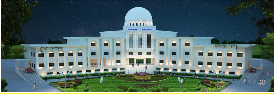
PROPOSED VIEW FOR ADMINISTRATIVE BUILDING