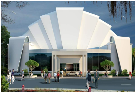
PROPOSED AUDITORIUM BUILDING