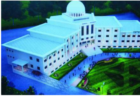
PROPOSED VIEW FOR ADMINISTRATIVE BUILDING