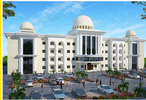
PROPOSED ACADEMIC BUILDING